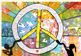
Signs of Peace