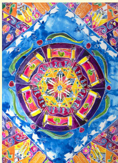
Holiday Kaleidoscope © Michele Pulver Feldman