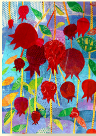
Peace and Pomegranates © Michele Pulver Feldman