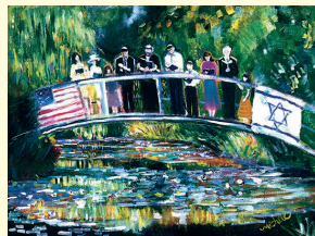
Prayer for Hope in Monet's Garden © Michele Pulver Feldman